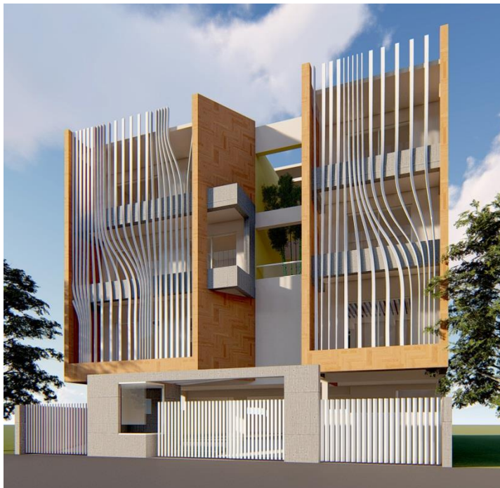
Rites Officers Guest house Location: Gurgaon Built-up area: 14,990 sqft Scope of Work: Architectural and interior design Status: Tendering stage Estimated cost: 820 lacs