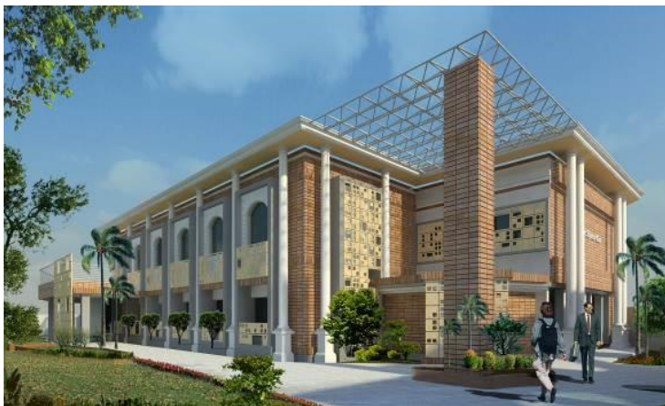
Alexander Athletics Club Location: Meerut Built-up area: 22,000 sq-ft. Scope Of Work: Renovation, Architectural and interior design Status: Under-construction