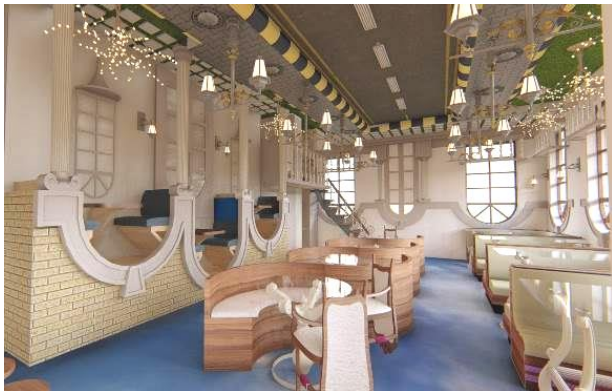
Tangy House, Bestech Chambers Location: Gurgaon Built-up area: 7,000 sq-ft. Scope Of Work: Planning and interior design Status: Complete