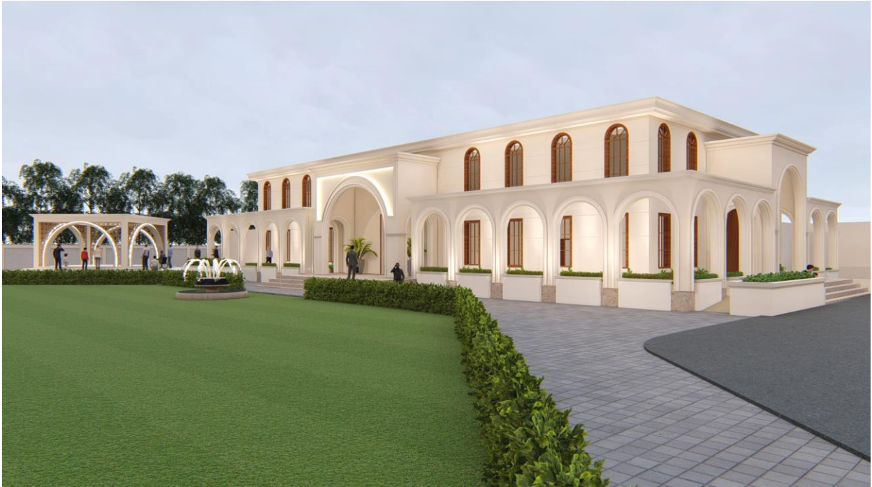
Kings court Banquet & Hotel Location : Bijnor Built-up area: 5000 sqft + 4000 sqft Scope of work : Planning and interior design Status : Under-construction