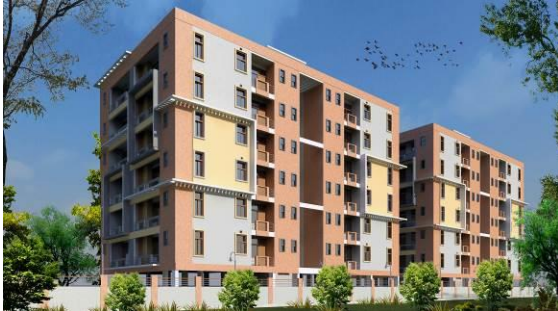
Navrachna Paradise Location: Col. Enclave road, NH-58, Roorkee Site Area: 30,000 sq-ft. Scope Of Work: Architectural design Status: Complete