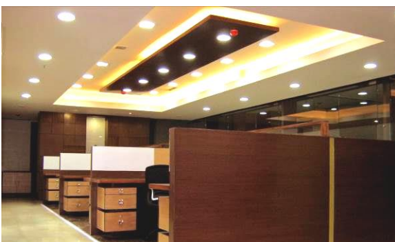
Elmech Engineers corporate Office, New Delhi Location: Jasola, New Delhi Area: 3,000 sqft Scope of Work: Planning, Interior Design and Site Supervision Status: Complete