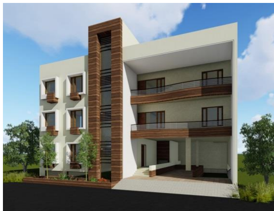
Sikar Hostel Location: Sikar, Rajasthan Built-up area: 25,000 sq-ft. Scope Of Work: Architectural design and Construction drawings Status: Planning stage