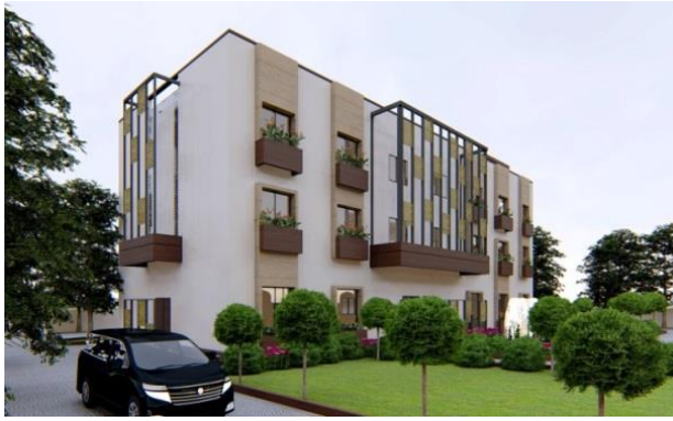
Banquet & Hotel Location: Bhagwanpur Built-up area: 16,000 sqft Scope of Work: Architectural design Status: Design stage