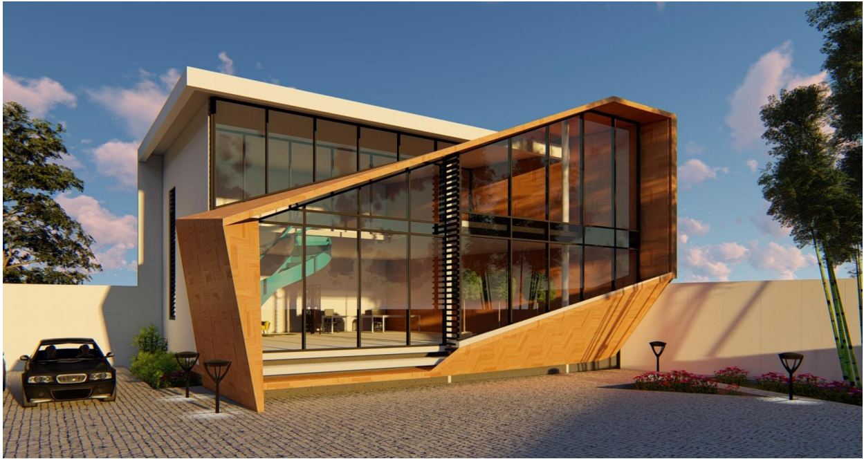
Ajanta Colonizers Ltd Office, Meerut Location: Meerut Scope Of Work: Architectural and interior design Status: Un-built