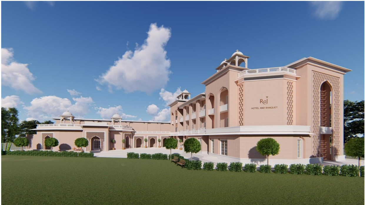
Raj Banquet & Hotel Location : Mirzapur, UP Built-up area: 6000 sqft + 26000 sqft Scope of work : Planning and interior design Status : Under-construction