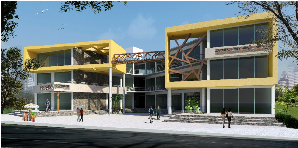
Vardhman Fortune Plaza, Ajanta Colonizers Ltd. Location: Baghpat Road, Meerut Scope Of Work: Architectural Design Status: Complete