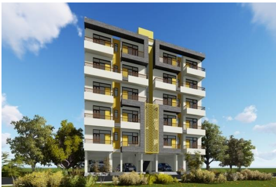
Balaji Homes Location: Sahibabad, Ghaziabad Site Area: 16,500 sq-ft. Scope Of Work: Architectural design Status: Complete