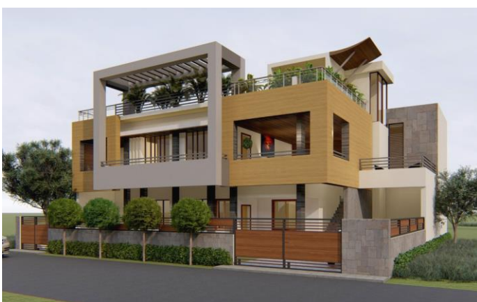
Mr Chauhan Residence Location: Roorkee Built-Up Area: 9,100 sq ft. Scope Of Work: Renovation design Status: Under-construction