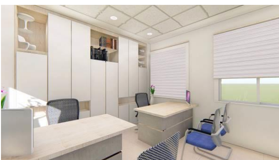
Avon Factory Location: Vijay Nagar, Ghaziabad Area: 3,000 sqft Scope of Work: Planning, Interior Design and Site Supervision Status: Under-construction