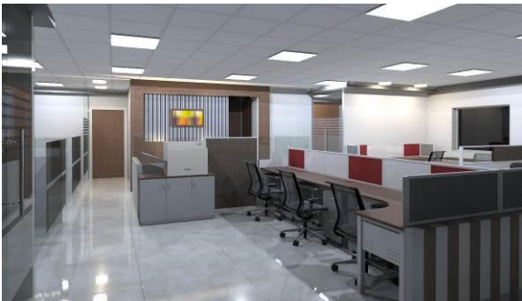
Chaudhary Hammer Works (CHW) corporate office Location: BS Road, Ghaziabad Area: 7,000 sqft Scope of Work: Upgradation, Interior Design and Site Supervision Status: Complete