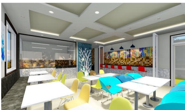
Schiller Sr Secondary school cafeteria Location: Ghaziabad Area: 1,400 sqft Scope of Work: Renovation, Expansion and Interior design. Status: Design Process