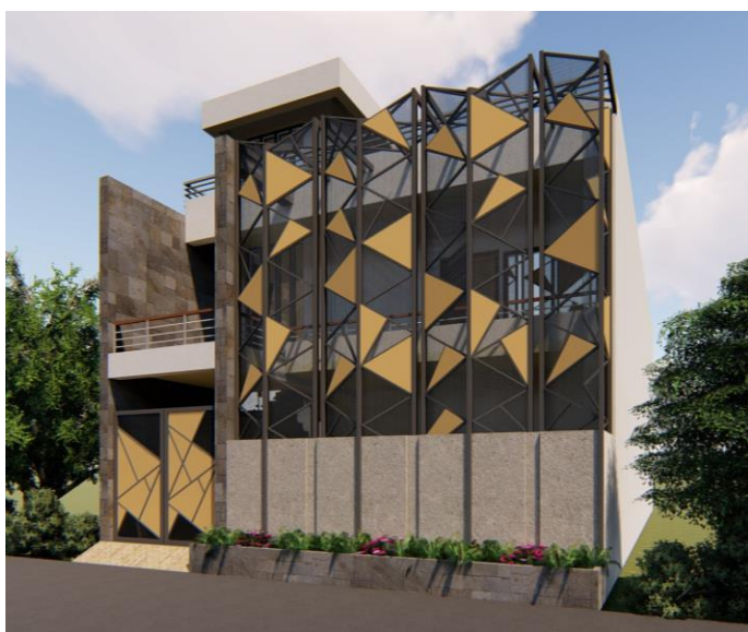
Mr Gagan Tyagi residence Location: Defence colony, Sahibabad Area : 6,200 sqft Scope of work: Architectural design Status complete