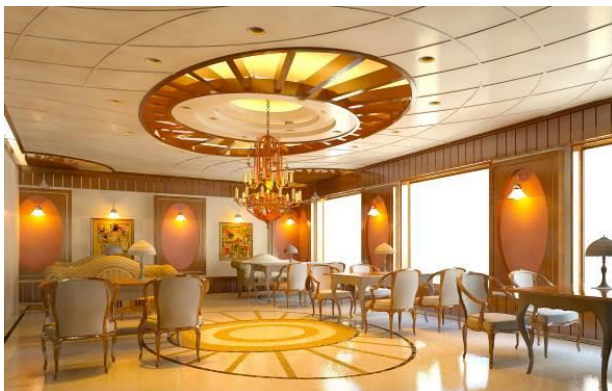
Family Hall, Alexander Athletics Club Location: Meerut Area: 3,000 sqft Scope of Work: Renovation, Expansion and Interior design. Status: Complete