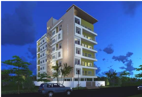
Aakash Apartments Location: Bongaigaon, Assam Built-up area: 30,000 sq-ft. Scope Of Work: Architectural design and Construction drawings Status: Under-construction