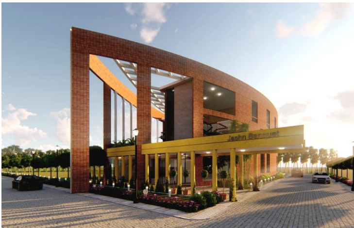
Jashn Banquet Hall at Big Bite campus Location: Meerut Bypass Built-up area: 30,000 sq-ft. Scope Of Work: Architectural and interior design Status: Un-built