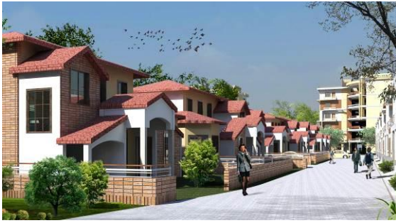
Dwarika Greens Location: Dehradun road, Roorkee Site Area: 80,000 sq-ft. Scope Of Work: Architectural design Status: under-construction