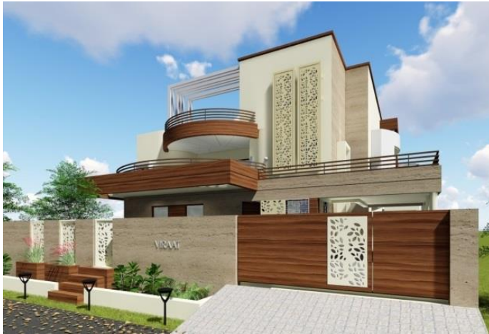
Mr. Yogesh's Residence Location: Raj Nagar, Ghaziabad Built-Up Area: 11,500 sq ft. Scope Of Work: Renovation and interior design. Status: Under-construction